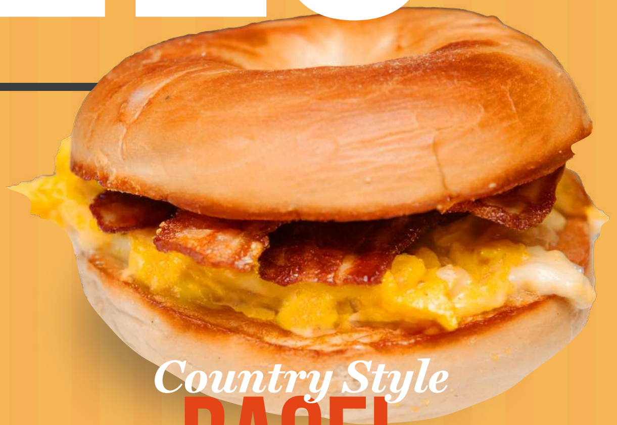
Country Style BAGEL Eggs & Bacon