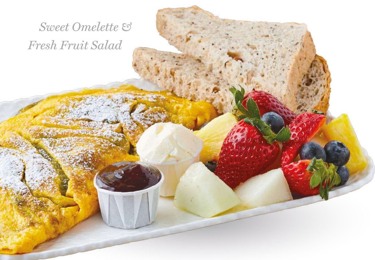
Sweet Omelette & Fresh Fruit Salad