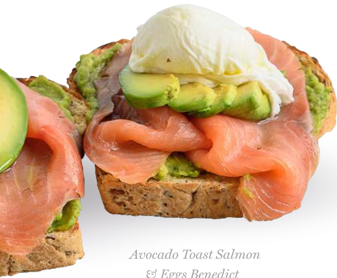
Avocado Toast Salmon & Eggs Benedict

Smoked salmon*, cream cheese, tomato, pickled capers