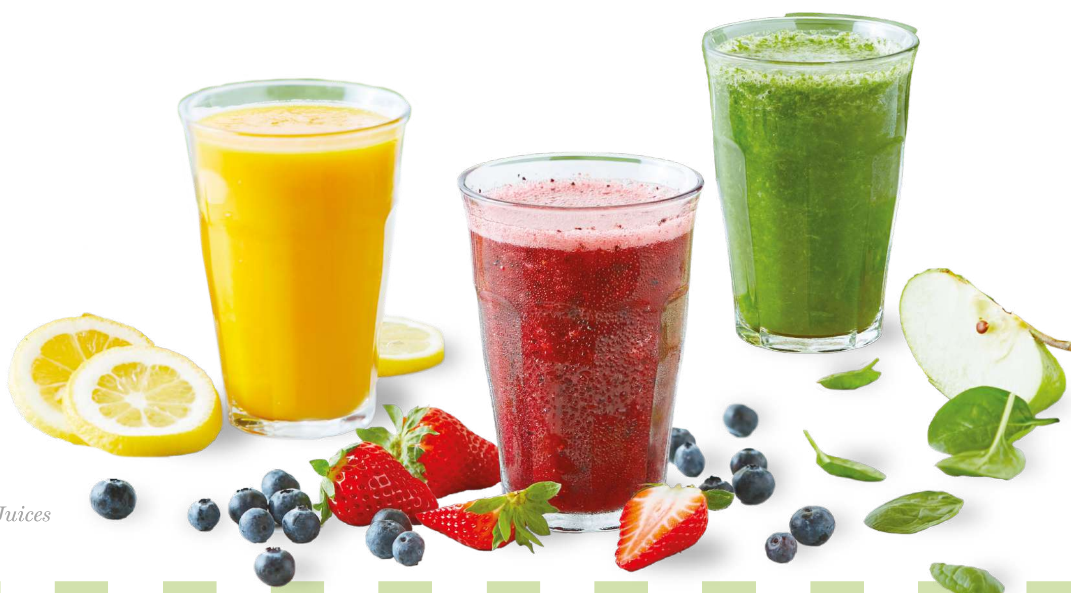
Fruit & Vegetable Juices