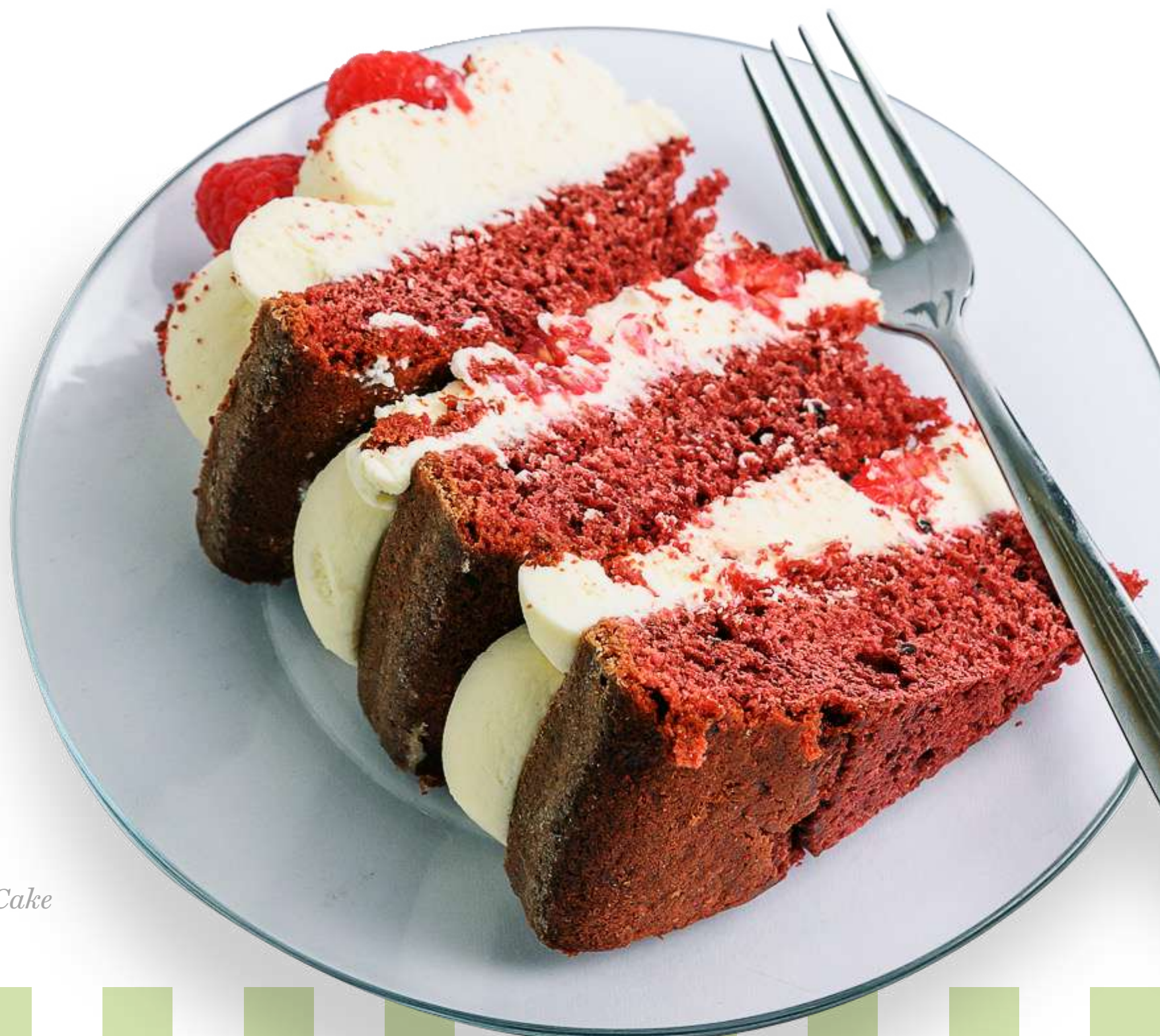
Red Velvet Cake

Carrot and fresh pineapple* cake with shredded coconut, pecans, spices, and light frosting