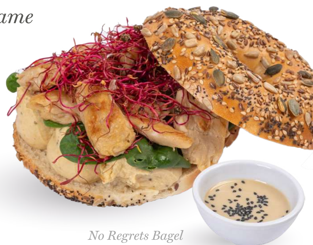
No Regrets Bagel

Multigrain bagel* (1)(11) , plant-based chicken*, chickpea hummus*, baby spinach, sprouts