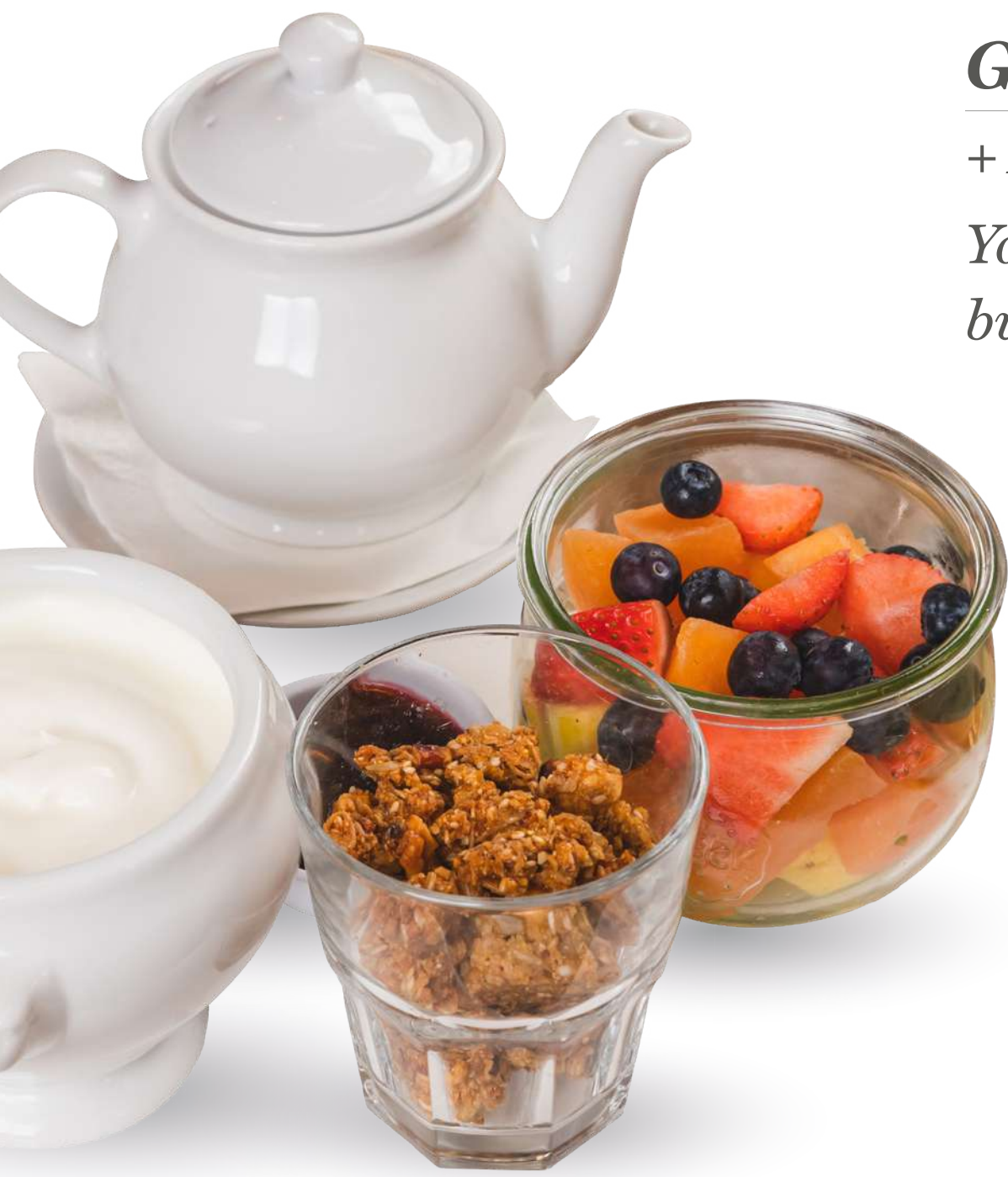
Granola & Yogurt + Fresh Fruit Salad