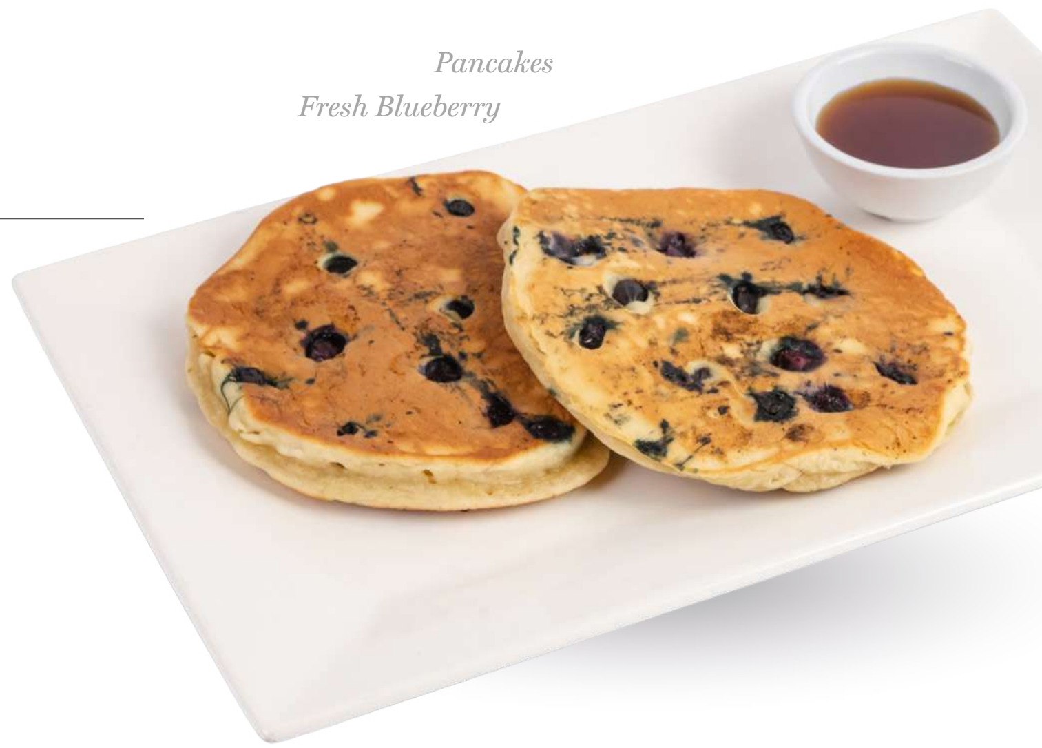
Pancakes Fresh Blueberry