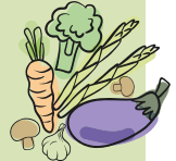
healthies & bowls