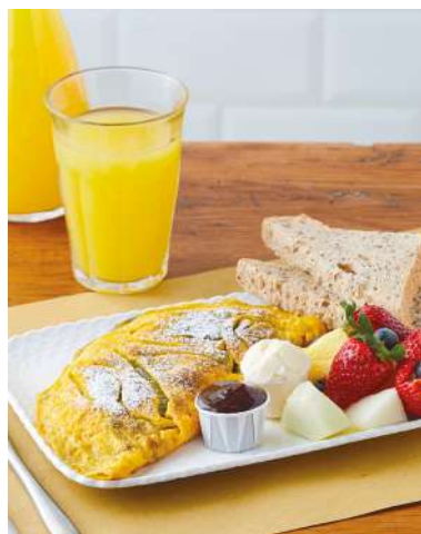
Union Square Sweet