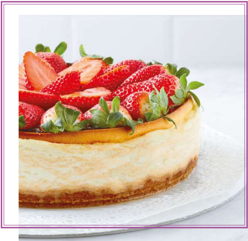
Strawberry NY Cheesecake