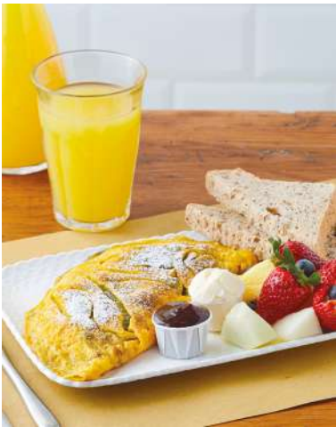
Union Square Sweet