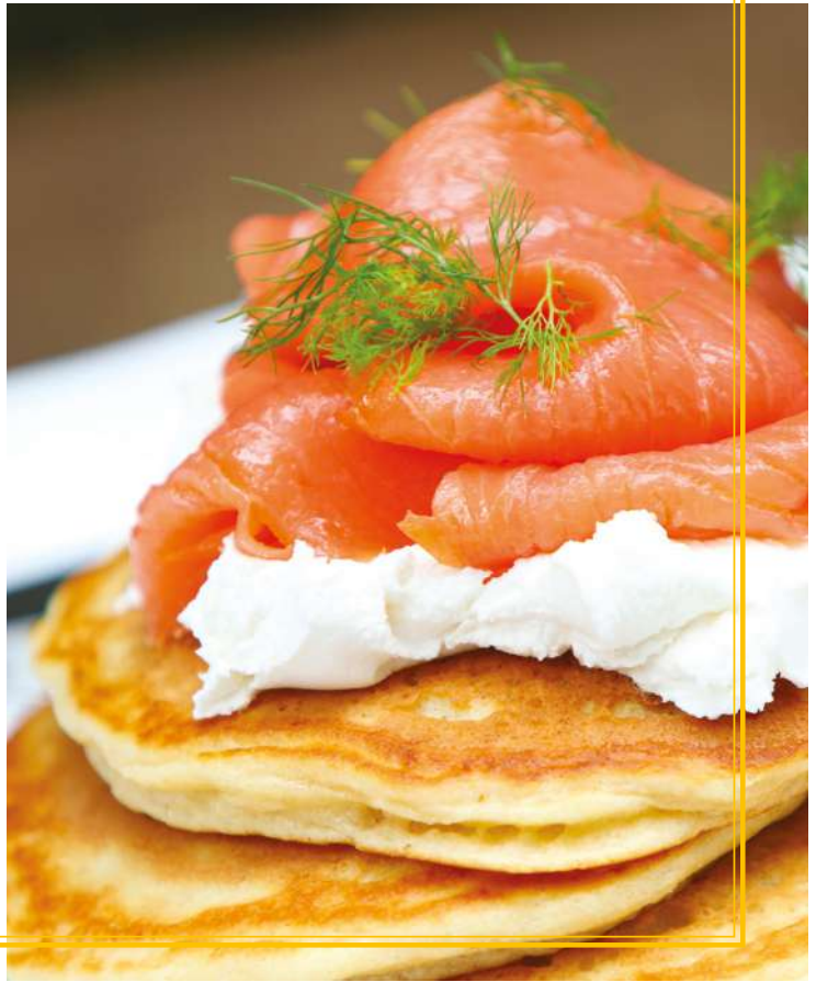
Pancakes Salmon & Cream Cheese