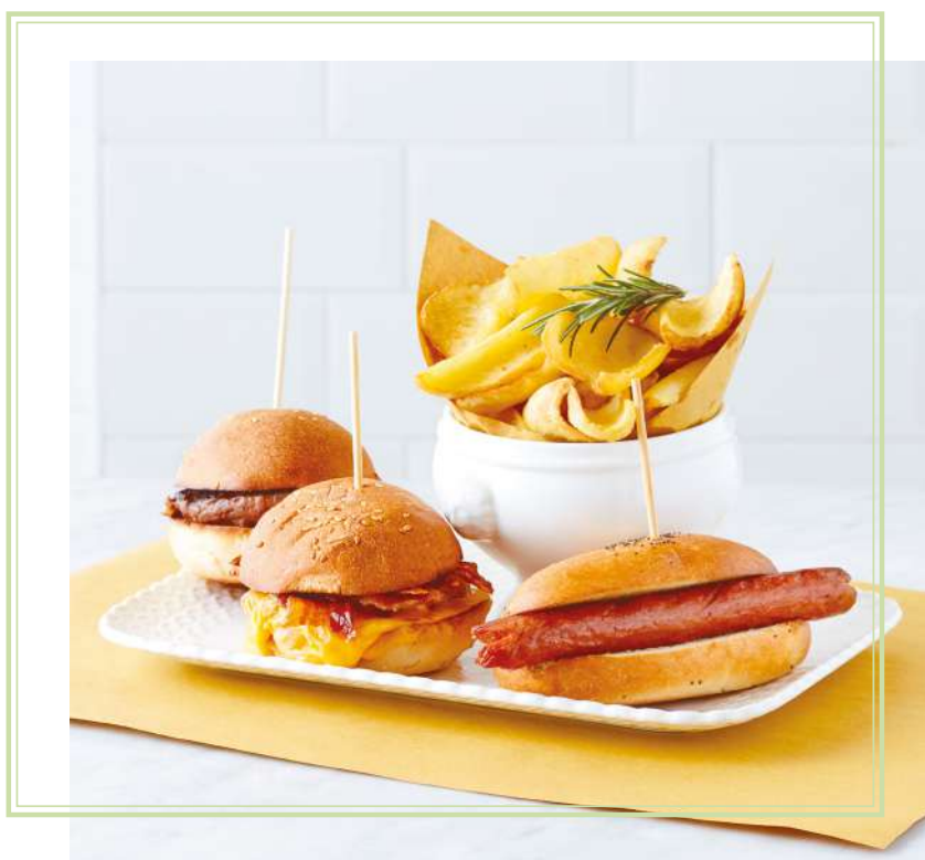
Mini Burgers & Mini Hot dog