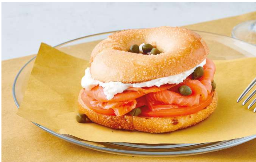
N.Y. Style Bagel