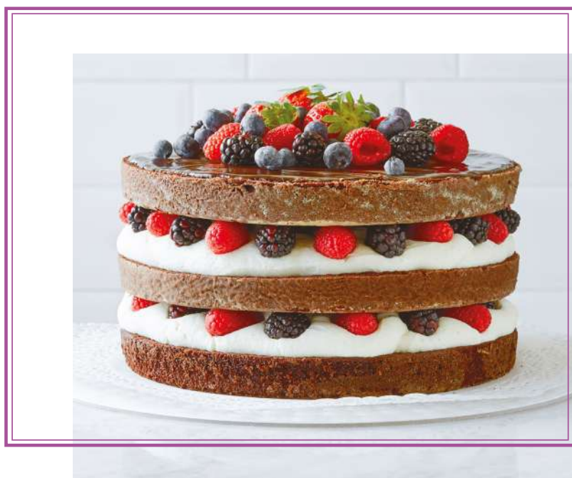
Devil's Food Cake