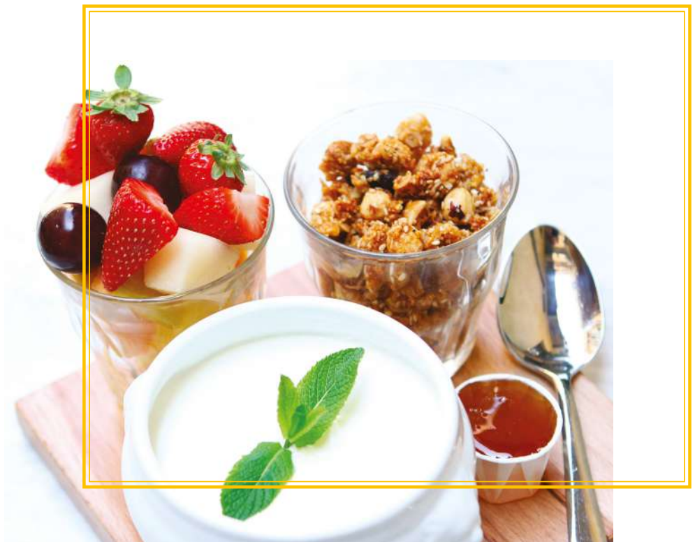
Granola & Yogurt + Fresh Fruit Salad