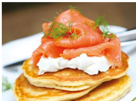
Pancakes Salmon & Cream Cheese