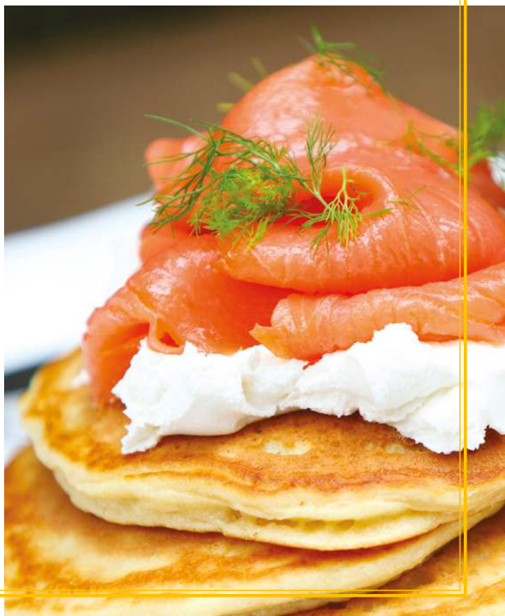
Pancakes Salmon & Cream Cheese