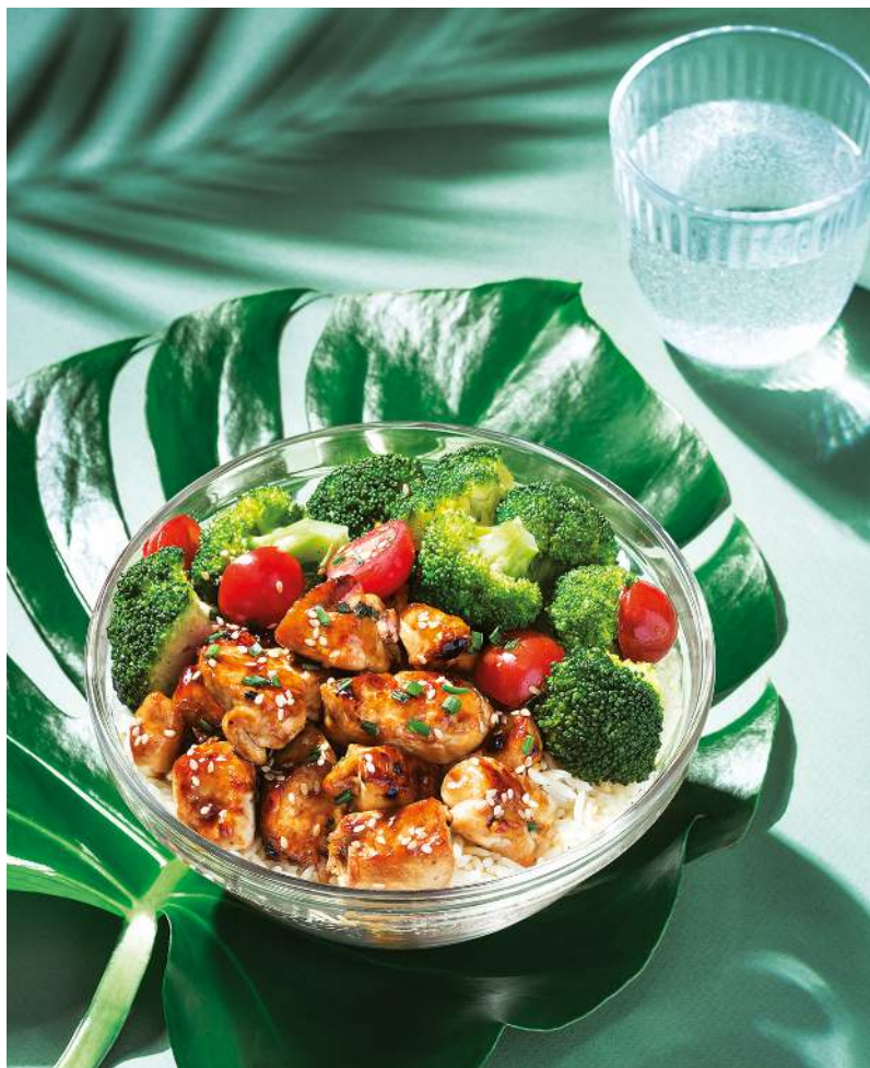
Teriyaki Chicken Bowl