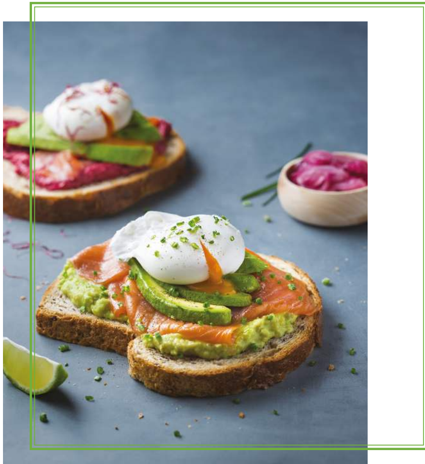
Avocado Toast Salmon & Eggs Benedict