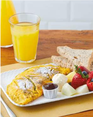
Union Square Sweet