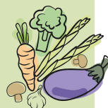
healthies & bowls