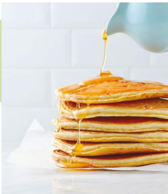
Pancakes with maple syrup

In our workshops, we work in an artisanal manner, taking our time: our bread is baked daily and processed according to rising times, with raw materials of natural origin, without the addition of additives or preservatives. Ours is a patient search, the result of twenty years of work that has brought us to know the best local products and their high quality.