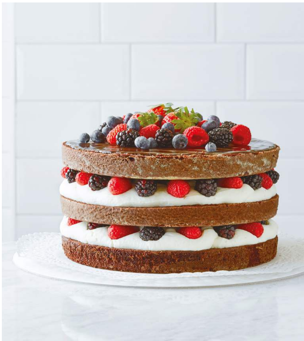
Devil's Food Cake