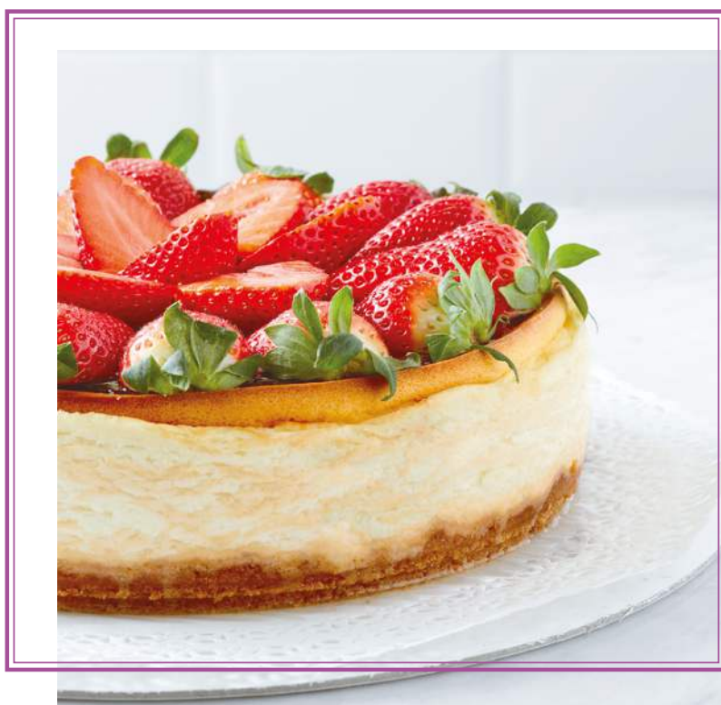
Strawberry NY Cheesecake